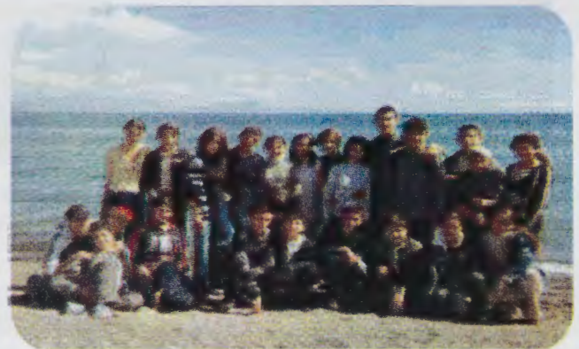
DIVERSITY GROUP IN THE LAKE SEVAN

I can't forget my trip to Sevan. I took part to training on Civil Rights issues. Before getting to Sevan we played games in the bus which helped us to improve our English. The game demanded everybody to speak English, and these who spoke Armenian were punished. The best speakers were awarded to do shopings from CYSCA's shop. Later, when we reached Lake Sevan we took classes in Civil Rights, Health way of life topics. After classes we walked around the beach and got acquainted with the nature of Lake Sevan. In the evening we returned back to Yerevan.