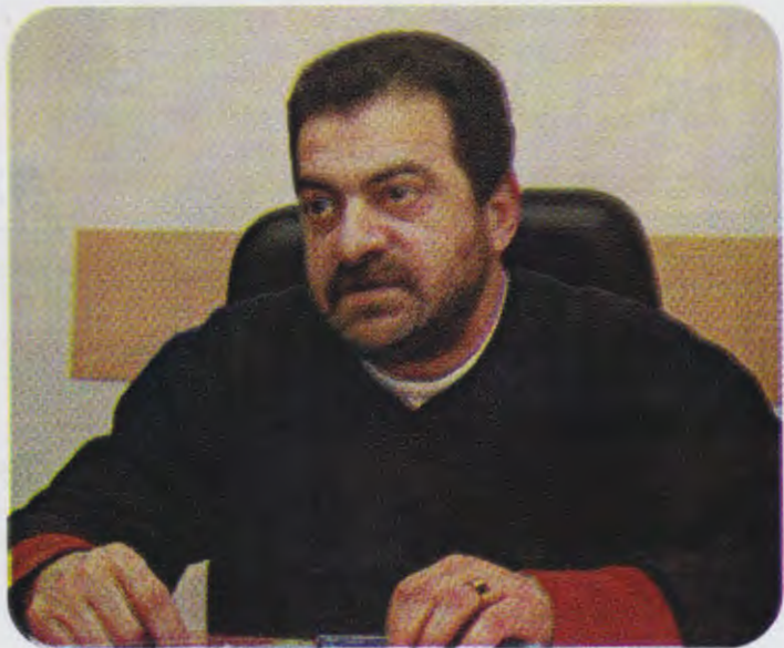
Meeting with Armenian famous, comedic actor Hrant Tokhatyan

Now I can say that my English has been improved very much because I took part to Diversity program activities that lasted over a month. This was an interesting program that really helped me to speak English better than before. Before being involved in the program I had to take part to a competition. There was held a contest of writing composition about volunteering. Later, based on the results of competition some of us were selected as winners thus having a chance to participate English language training. A schedule was developed for the training and in the frame of the program activities we had several interesting trips and also watched educational films concerning different historical periods of Armenia. I am deeply impressed all these events and I wish this program should be continued in the future.