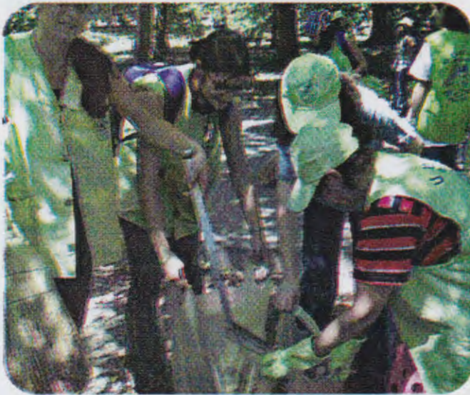
Clean Up Day