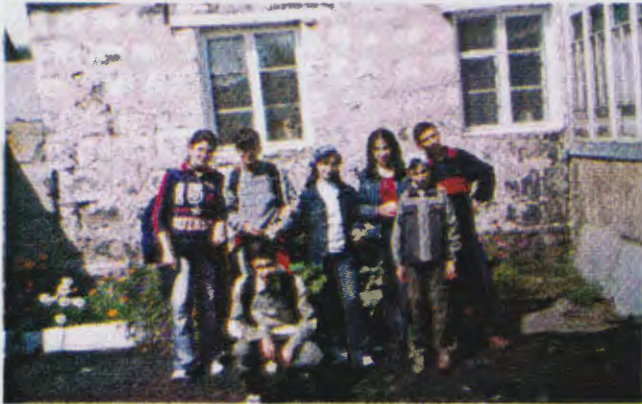
DIVERSITY GROUP IN THE VILIGE